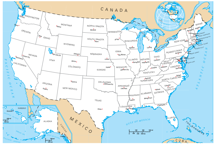
Map of the United States including state capitals.

The Constitution did not establish political parties. President George Washington specifically warned against them. But early in U.S. history, two political