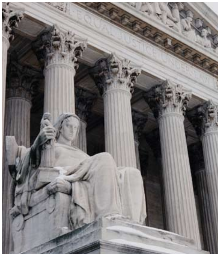
The Contemplation of Justice statue outside the U.S. Supreme Court building in Washington, D.C.

The judicial branch is one of the three branches of government. The Constitution established the judicial