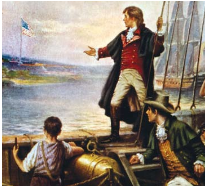
In “The Star-Spangled Banner,” by Percy Moran, Francis Scott Key reaches toward the flag flying over Fort M’Henry.

In the United States, we celebrate Independence Day on July 4 to mark the anniversary of the adoption of the Declaration of Independence. After signing the Declaration of Independence, John Adams wrote to his wife, “I am apt to believe that it will be celebrated, by succeeding Generations, as the great anniversary Festival.” The Declaration of Independence, written by Thomas Jefferson, explained why the colonies had decided to separate from Great Britain. Americans celebrate the Fourth of July as the birthday of America, with parades, fireworks, patriotic songs, and readings of the Declaration of Independence.